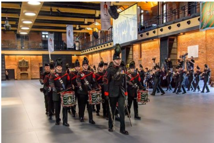
Parading in the rededicated drill hall of Les Voltigeurs de Québec