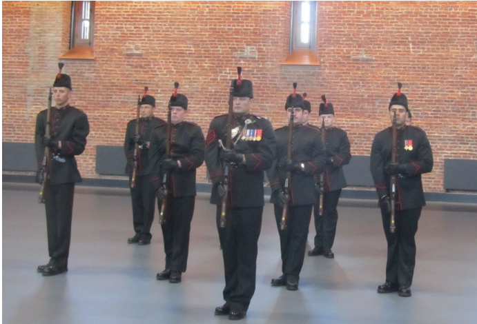
Les Voltigeurs parading in the historic RRC parade uniforms

(more photos are available in Facebook at this link: https://www.facebook.com/groups/HongKongVets/ - scroll down to May 27)