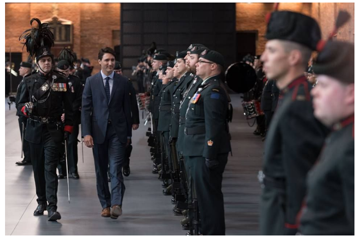
Prime Minister Justin Trudeau inspecting Les Voltigeurs de Québec