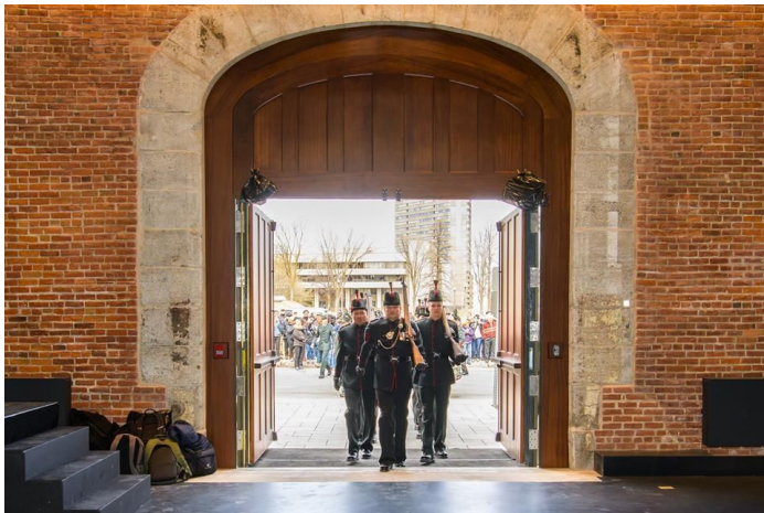
Parade, entering the drill hall

RRC Veterans you are back home with the RRC plaque in its proper place and your Banner hanging from the rafters in Le Manège Militaire des Voltigeurs de Québec.