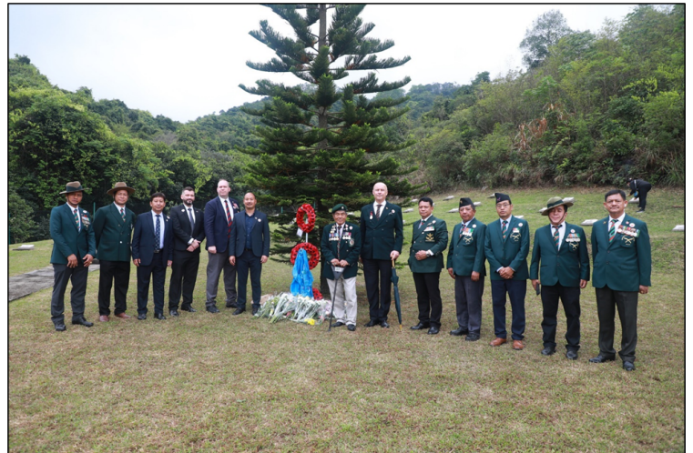
Unity in Remembrance: The Purkha Divas 2023 Ceremony in Hong Kong

Though my participation in the ceremony was unofficial, I proudly donned my HKVCA blazer and conveyed our association's deep respect for these brave souls. I aspire to attend next year's event in an official capacity, laying a wreath on behalf of the HKVCA to honour these veterans. While their service period differs from that of the Canadians we commemorate, their dedication and bravery in defending Hong Kong equally deserve remembrance.