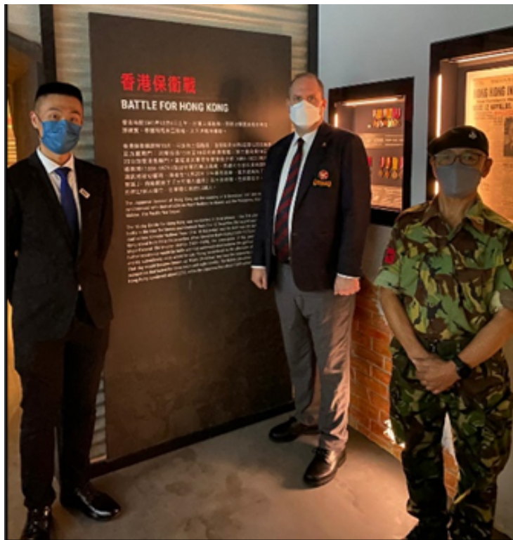
Resilient Return: Reopening of the Hong Kong Museum of Coastal Defence

This reopening marked the introduction of a new, updated, revitalized permanent exhibit within the museum's historic redoubt, comprising 11 engaging galleries. Each gallery provides a window into different chapters of Hong Kong's coastal defence history, including the War of Resistance against Japanese Aggression and the consequential Battle of Hong Kong.