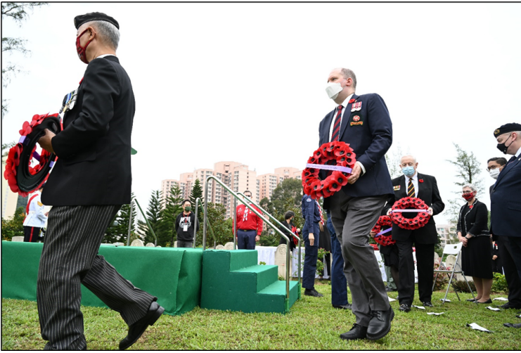
Salute to Valour: The 75th Canadian Commemoration Ceremony at Sai Wan War Cemetery

This solemn ceremony served as a tribute to the 1,975 heroic Canadians who took part in the Battle of Hong Kong and also as a memorial for the 550 brave souls who tragically lost their lives in battle or captivity. These events are a testament to these soldiers' incredible bravery and resilience.