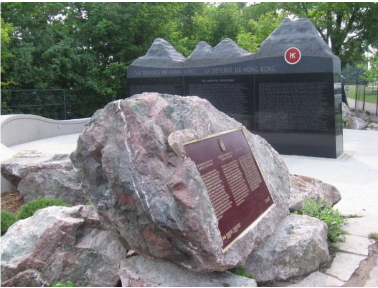
Hong Kong Memorial Wall, Ottawa.

The idea is that by posting a QR code on the site, visitors can scan the image with their smartphone and be brought to information that the HKVCA controls.