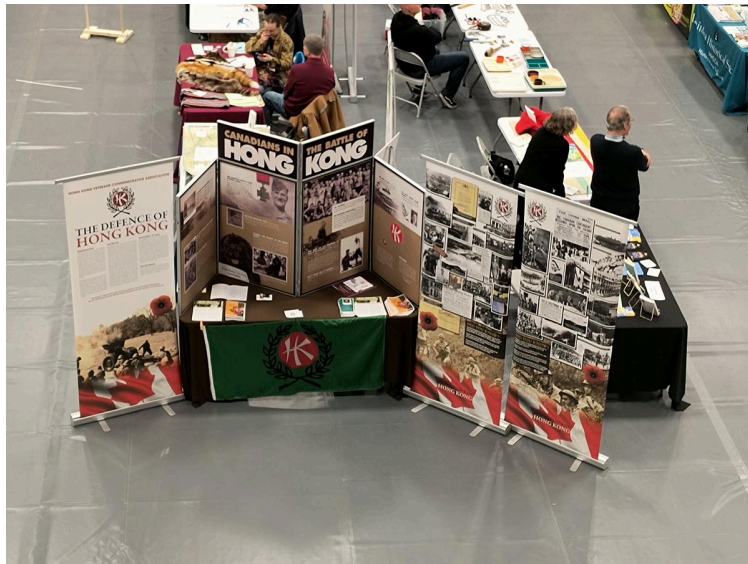
Red River Heritage Fair display