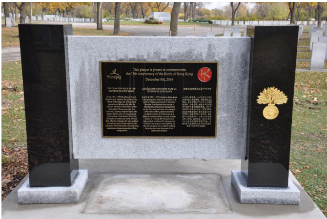
Looking East 75th Anniversary plaque with Grenadiers grenade on the pillar