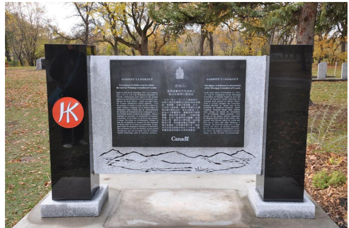
Looking West with the Jardine's Lookout plaque and the Red shoulder patch with white HK on the pillar.