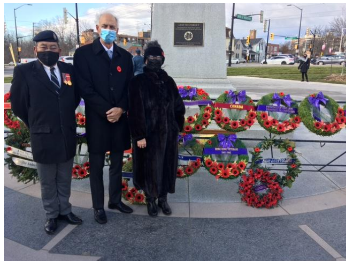
Markham Cenotaph on Dec 4