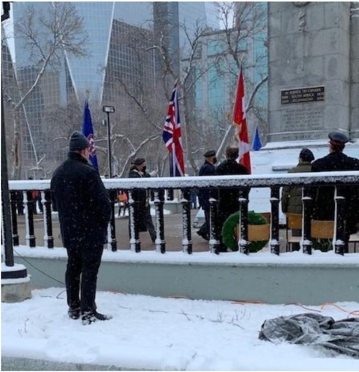
Service in Regina