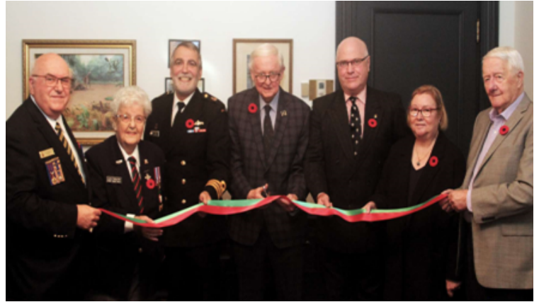
Official cutting of the ribbon at the opening of the Lounge

From the Quebec Executive and all members, we wish you all a wonderful Christmas Season and Health for the New Year.